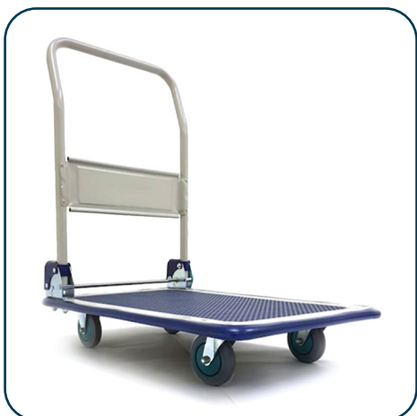
Foldable Platform Hand Truck Load Capacity 150 KG ₹ 4,650.00 Size : 740 x 480 x 860 (mm)