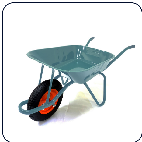
Single Wheel Barrow Load Capacity 150 KG ₹ 2,900.00