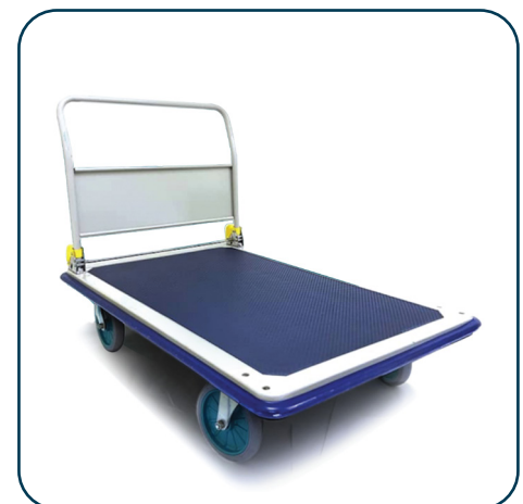
Foldable Platform Hand Truck Load Capacity 500 KG ₹ 12,650.00 Size : 1280 x 850 x 900 (mm)