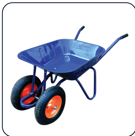
Double Wheel Barrow Load Capacity 200 KG ₹ 3,750.00