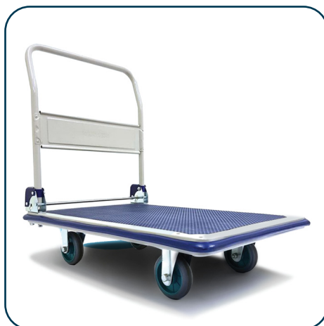
Foldable Platform Hand Truck Load Capacity 300 KG ₹ 6,950.00 Size : 910 x 610 x 860 (mm)