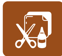
Crafts and Hobbyist